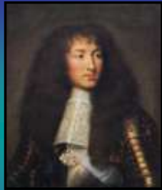
Louis XIV: (1643-1715)

Therefore they were only answerable to god (not to the people). He was the most powerful ruler of his time.