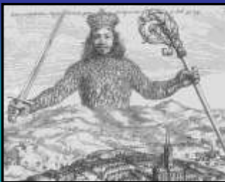
Thomas Hobbes: (1588-1679)