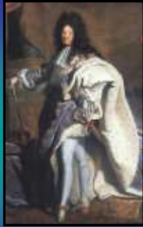
Louis XIV: (1643-1715)

Ruled France as an absolute monarch. He believed in the Divine Right of Kings, and that kings received their authority from god.