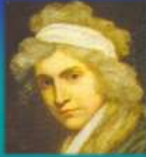
Mary Wollstonecraft: (1759-1797)

She said that women's inferiority was not natural but was rather a consequence of their mis-education, a mis-education imposed on them by men.