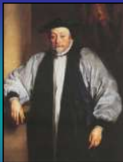
William Laud: (1573-1645)

Head of the Church of England, and supported the Divine Right of Kings. He said also that the church was, (naturally) the right hand of the King.