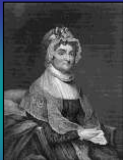
Abigail Adams: (1744-1818)

She frequently made suggestions about the new government's formation.