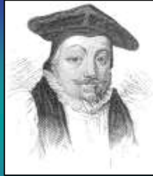
William Laud: (1573-1645)

So the King and the Church should work together. He severely punished those that didn't support his church.