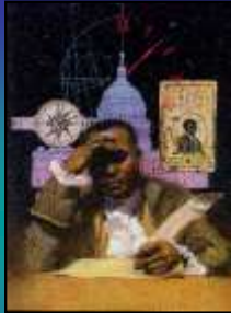
Benjamin Banneker: (1731-1806)

Wrote to Thomas Jefferson, and pointed that colonists had fought to end enslavement under British rule. Argued that maintaining slavery was simply illogical.