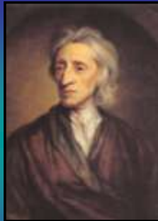
John Locke: (1632-1704)

English philosopher who believed that people had the ability to reason, and make good decisions when given the proper information.