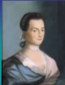
Abigail Adams: (1744-1818)

Wrote letters to her husband (John Adams) urging Colonial Independence. Reminded John not to forget about women's rights in the new United States.