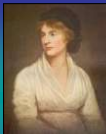
Mary Wollstonecraft: (1759-1797)

English writer who argued for equal rights for women. Wrote the book A Vindication of the Rights of Women (1791). She argued that women should have equal rights in business and governments.