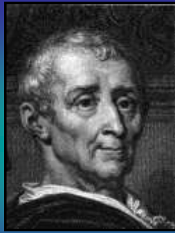
Baron de Montesquieu: (1689-1755)

French political theorist who established the idea of separation of powers. This idea meant that government power should be divided